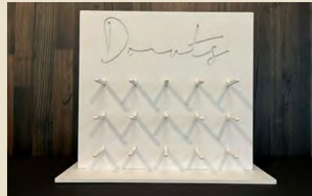
Donut Wall With Donuts