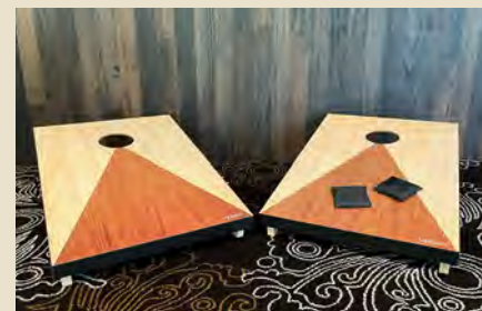
Bean Bag Toss x2