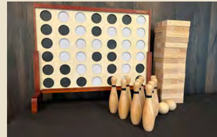
Connect 4 (Plain), Jenga (Plain) & 10 Pin Bowling