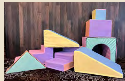
Soft Play Equipment